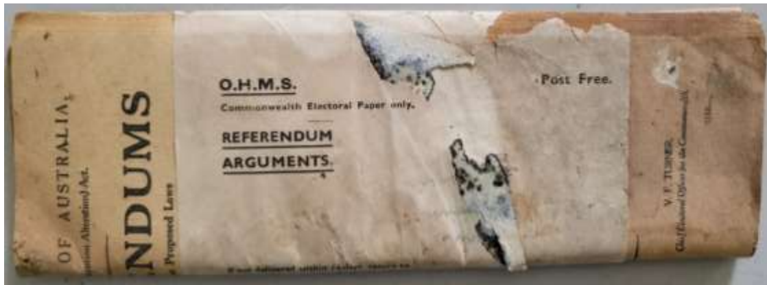
The unopened referendum information.