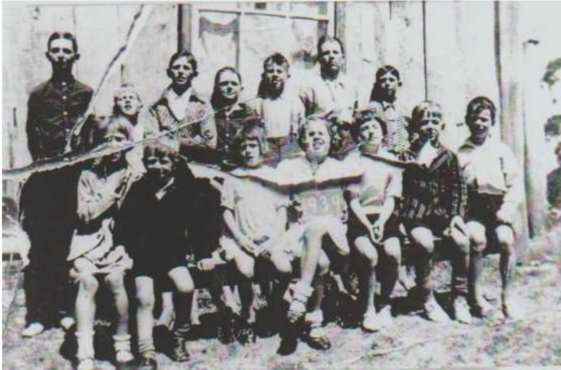
Fernbank School 1939