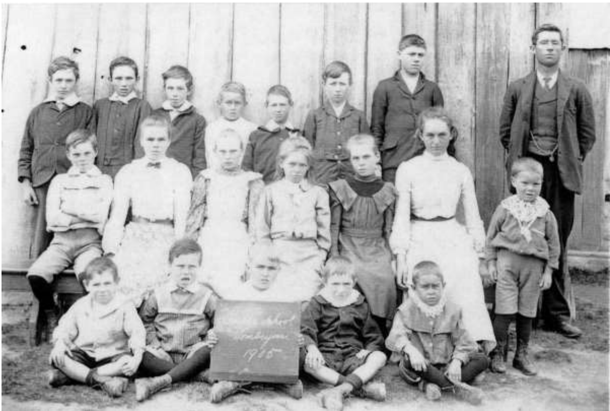
Fernbank (sometimes known as Wombeyan) School Pupils 1905