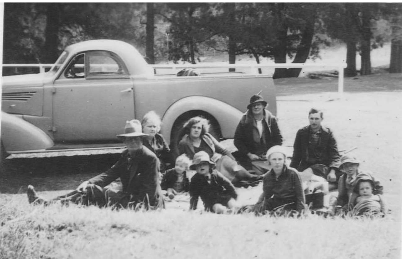
Wombeyan Caves 1937