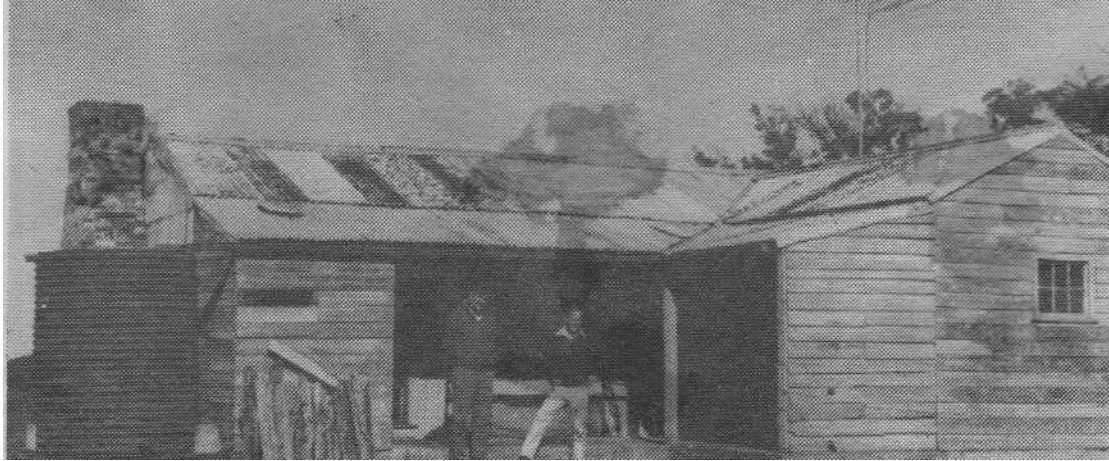
This is the old Blink Bonnie homestead once owned by J.T. Menzies in the Cookbundoons. Now run by Trevor Menzies the old house is still used as an out-station during shearing