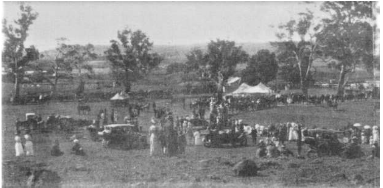
Taralga Show 1916