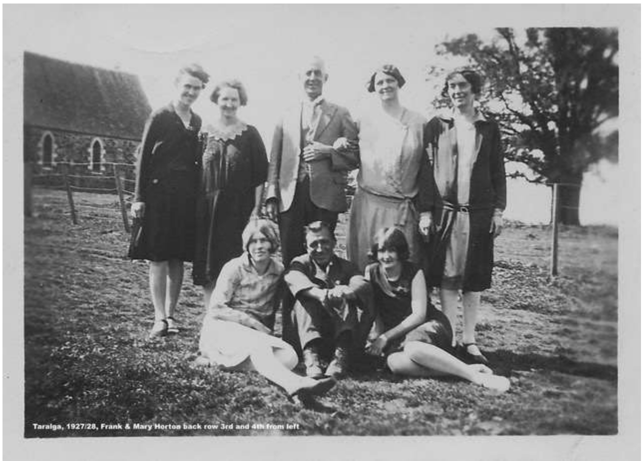
Near the Methodist Church - now The Taralga Historical Society