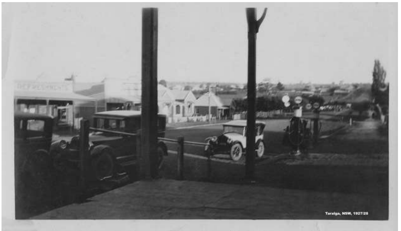
Outside the Argyle Hotel