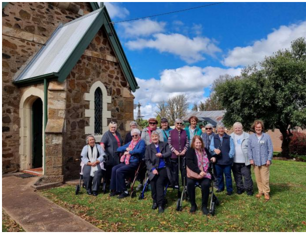
Goulburn Day View Club visited Thursday 21 st April A few of the ladies had Taralga and District Ancestry