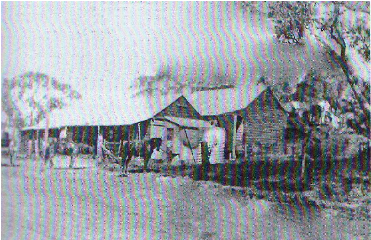
Myrtleville General Store and Post Office about 1920 or a little earlier.

Post Office Directory of 1867 with the names of Householders who resided in Myrtleville Postal District