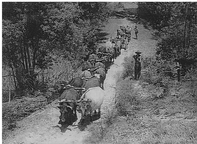
Hauling an empty timber wagon up The Swallowtail Pass