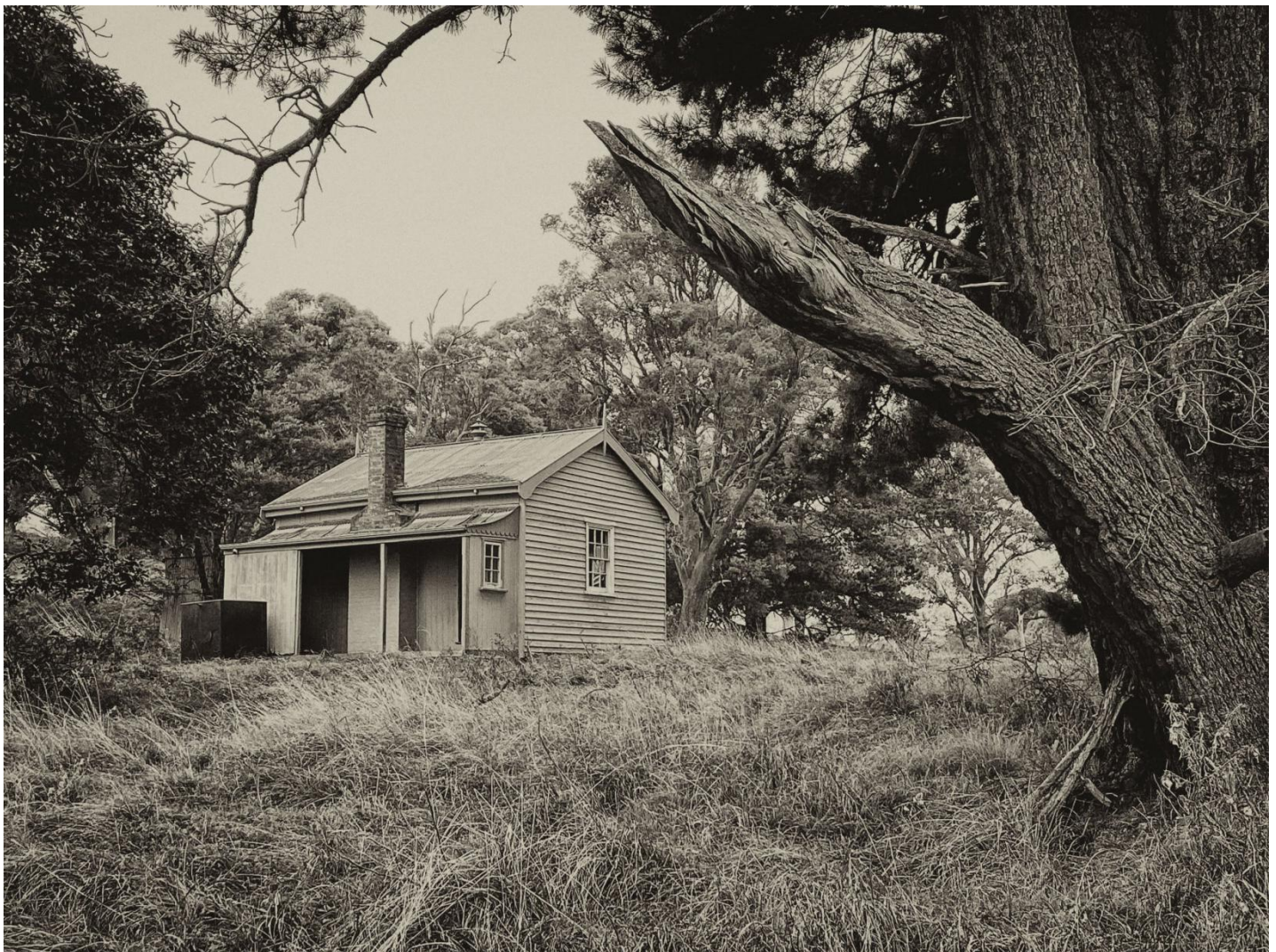
BURRA LAKE SCHOOL

In contrast to the rough, steep hills further out the flat nature of the land at the lake has provided an escape for at least two aeroplanes forced to land in separate incidents. The first landing was in William McPaul's paddock during the 1930's.. then about 1944 a plane came in from the north, circled the lake and made a forced landing in Ned Cusack's paddock. There were no casualties in either case but they aroused a great deal of interest, particularly among the children of the area.